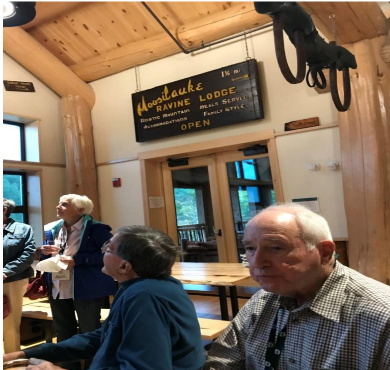
Original Moosilauke Ravine Lodge Sign and the Lodge Front