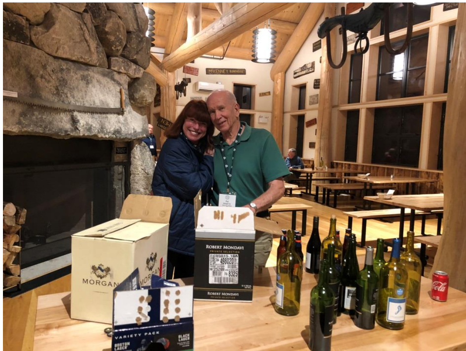
The Wrap Up of a Tour and Party 1953 Style